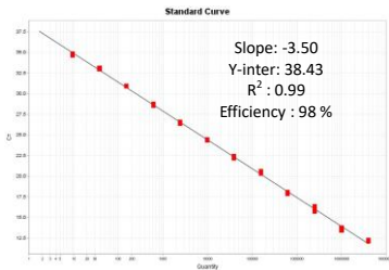
Fig. 2. The standard curve of TQ1210 ExcelTaq™ 2X Fast Q-PCR Master Mix (SYBR, ROX).