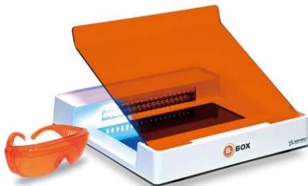
B-BOX™ Blue Light LED epi-illuminator