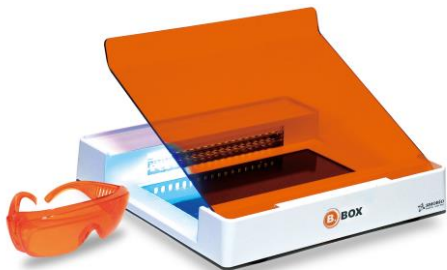
B-BOX™ Blue Light LED epi-illuminator